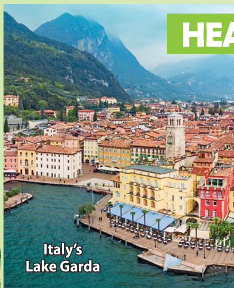
Italy's Lake Garda

Includes meals as listed, hotels, Tour Manager and motor coach transportation in Europe. Number of days includes air travel. For exact prices with Air from over 100 U.S. departure cities, call for a FREE Image Tours Europe brochure.