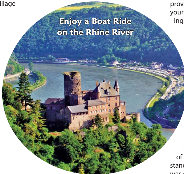
Enjoy a Boat Ride on the Rhine River

Your hotel for the next two nights will be in Trier, the oldest city in Germany, located near the three-country border of France, Luxembourg and Germany. ( Breakfast , Dinner )