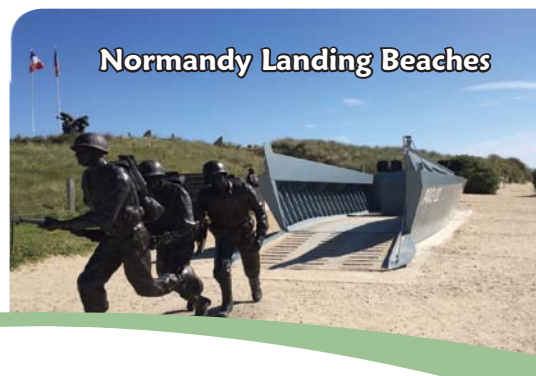
Normandy Landing Beaches

R evisit the dramatic history of WWII at famous battle sites, war museums and memorials. Many scenic and cultural highlights are also included, providing an enjoyable combination of learning and leisure.