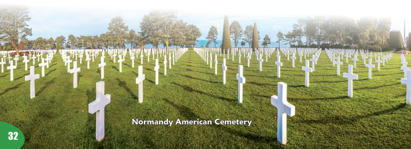
Normandy American Cemetery

DAY 10 - HOLLAND .. Groesbeek – Nijmegen – South Holland. Crossing the border, focus on sites significant to World War II liberation efforts in The Netherlands (Holland), including locations associated with Operation Market Garden. The bridge over the