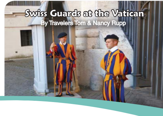
Swiss Guards at the Vatican