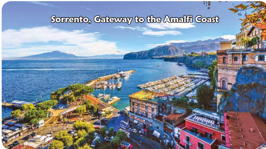
Sorrento, Gateway to the Amalfi Coast

For tour dates & prices, see brochure insert or ask your travel agent