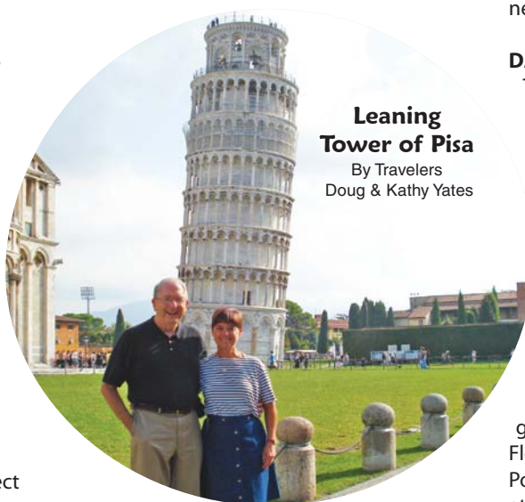
Leaning Tower of Pisa

DAY 5 - Venice. Today features a full day visit to the romantic city of Venice, known for its characteristic canals, colorful gondoliers and magnificent St. Mark's Square. All transportation is done exclusively over water, so like the Venetians, you will take a boat ride to the center of this "floating city." A guided walking tour follows, ending with a visit to a glass-blowing workshop where