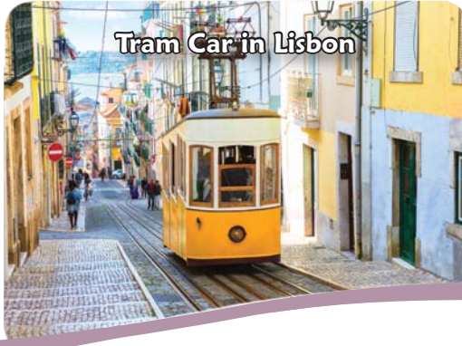
Tram Car in Lisbon