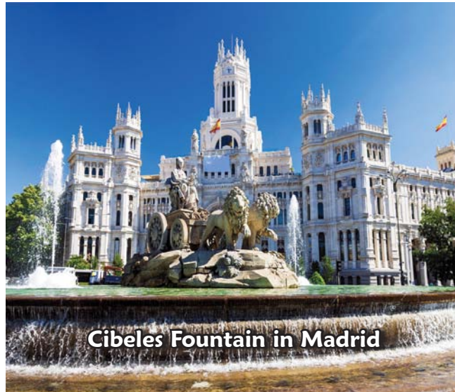
Cibeles Fountain in Madrid

Take a stroll through the Old Town where splashing fountains decorate the patios and floral aromas fill the air. Depart Córdoba to travel among the infinite olive groves and rolling mountains of Jaén Province. You will overnight in Baeza, declared a World Heritage Site by UNESCO. The town