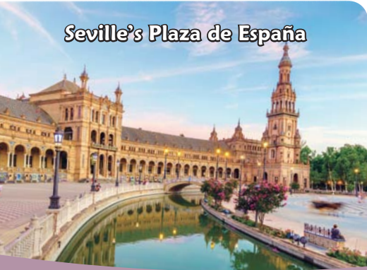
Seville's Plaza de España