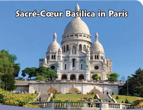
Sacr -C ur Basilica in Paris