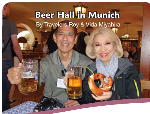
Beer Hall in Munich