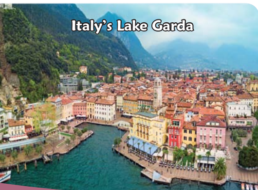
Italy's Lake Garda

15-day tour featuring Germany, Austria, Italy, Switzerland, France, Belgium and Holland