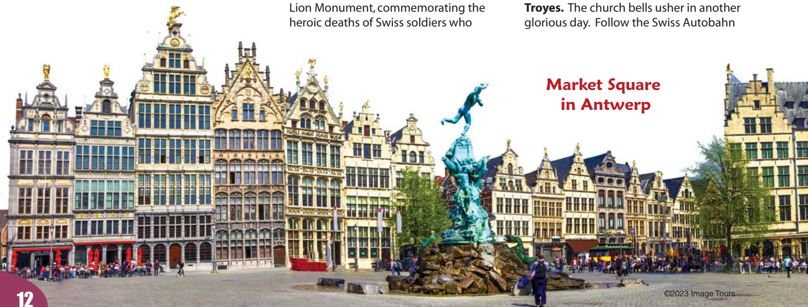
Market Square in Antwerp

DAY 10 - FRANCE . . Champagne Region - Troyes. The church bells usher in another glorious day. Follow the Swiss Autobahn