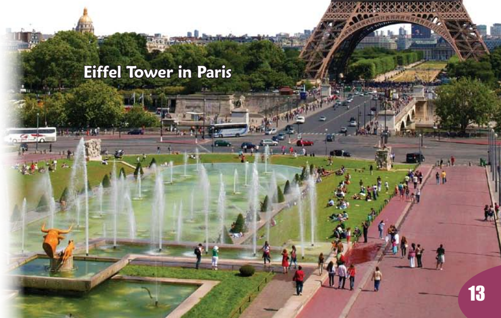
Eiffel Tower in Paris

Your journey of Europe's scenic, cultural and historic highlights has come full circle. You will forever remember the many sights, sounds and tastes from this wondrous adventure. Transfer to the Frankfurt Rhein-Main Airport for your flight home. We sincerely hope you will return and experience more of Europe's treasures with Image Tours. Until we see you again — "Auf Wiedersehen!" ( Breakfast )