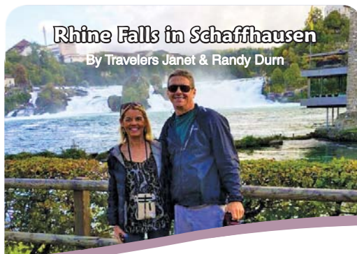
Rhine Falls in Schaffhausen