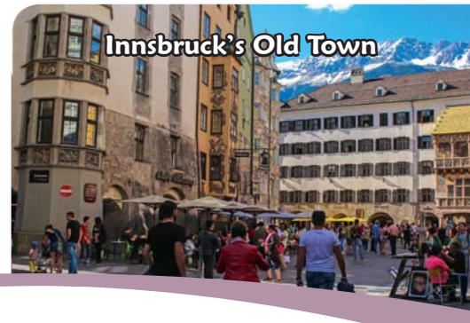
Innsbruck's Old Town