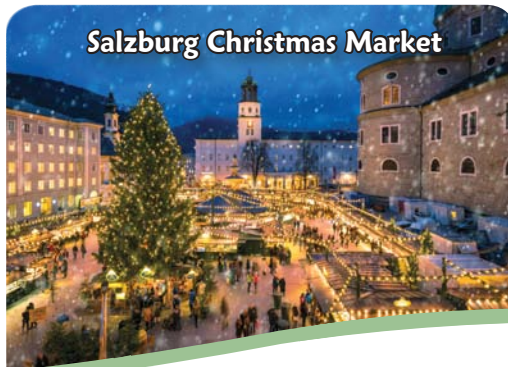
Salzburg Christmas Market