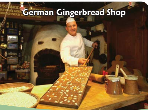
German Gingerbread Shop

11-day tour featuring the Christmas Markets of Salzburg, Innsbruck, Augsburg, Nuremberg, Rothenburg and Rüdesheim