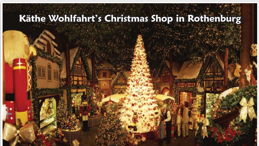
Käthe Wohlfahrt's Christmas Shop in Rothenburg

DAY 11- Daytime flight back to U.S.A. Transfer to the Frankfurt Airport for your return flight home. ( Breakfast )