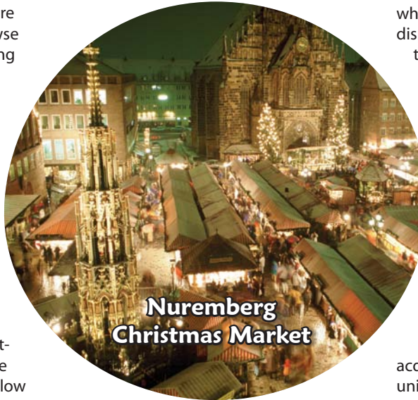
Nuremberg Christmas Market

DAY 8 - GERMANY .. Nuremberg. As you transfer into the city center, view some of Nuremberg's historic landmarks. Spend most of the day on the main Market Square, taking in the ambience of what many consider to be Germany's most beautiful Christmas Market. All will delight in the Children's Market, and you will find gifts from all over the world at the international Market of the Sister Cities on the neighboring square. The Toy Museum (approximately €7 admission fee), celebrating Nuremberg's tradition as the "City of Toys," is also within walking