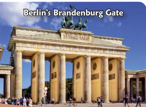
Berlin's Brandenburg Gate