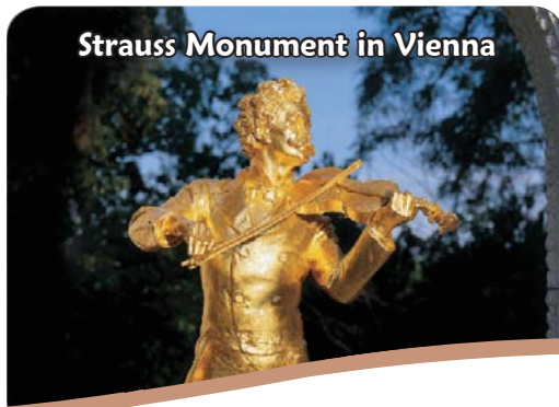
Strauss Monument in Vienna